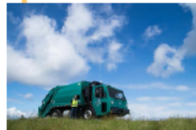
Tacoma Solid Waste

See UGA-4 Joint Planning in the Countywide Planning Policies for more information on adopted joint planning policies and procedures.