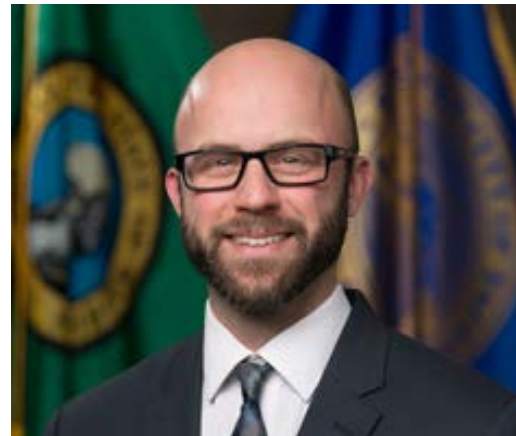
Chris Beale Tacoma City Council – District 5